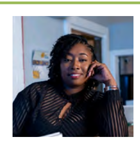
Kenya Congress Royalty Funnel Cakes

In the spring, students pitch their businesses in a "sharktank-like" event. Judges review business plans, listen to pitches, and ask questions of each student to determine the strength of their business plans.